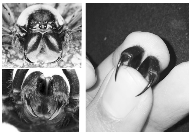
Fig 4 : Tarantulas fangs for injecting venom. It is like venom teeth of venomous snakes.