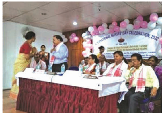
International Nurses Day 2022