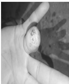
Figure 1B : Recovering fingertip after amputation.