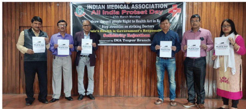
IMA Tezpur Protest against RTH BILL Rajasthan