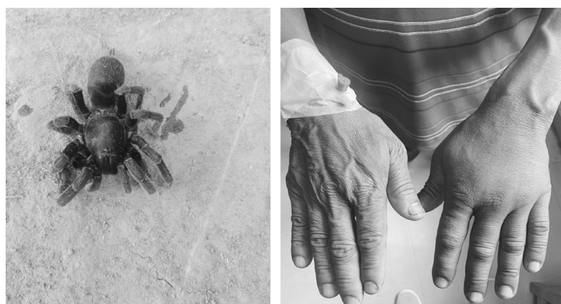
Fig 3 : Chilobrachys species. Severe pain and swelling 32hrs post bite .Received treatment in 3hrs after bite. Recovered well.