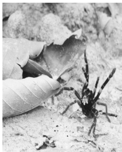
Fig 5 : Tarantula defensive behaviour before attack.