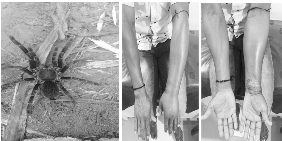
Fig 2 : Chilobrachys species bite followed by secondary infection(Abscess and swelling upto elbow joint)