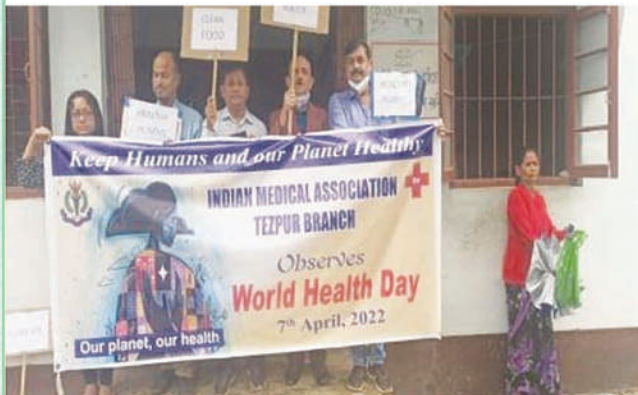
World Health Day 2022