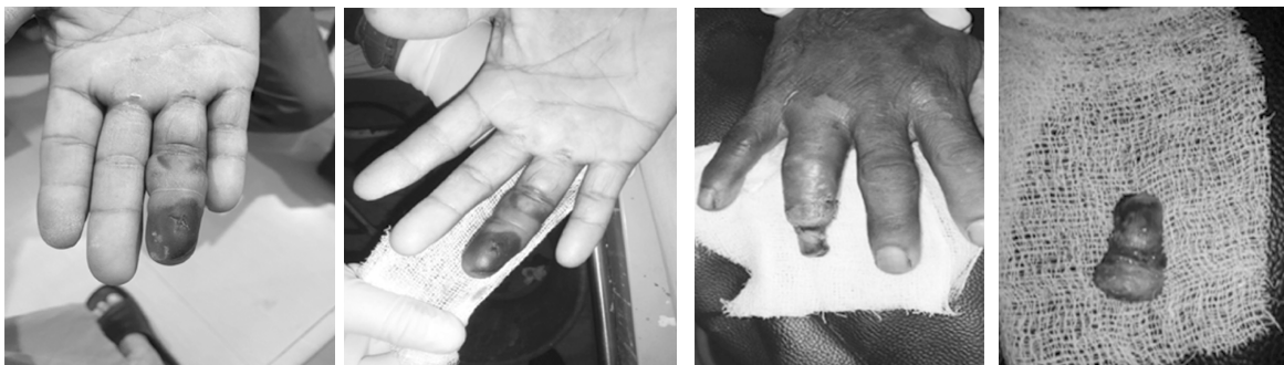
Figure 1A : Fingertip necrosis and amputation of the tip

Treatment of tarantula related injuries requires a comprehensive efforts from arachnology department, health care workers and public[13].We need to collaborate for better understanding its venom and symptoms. Because of paucity of documented data, we must consider spider bite in patients with symptoms by unknown bite in our differential diagnosis.