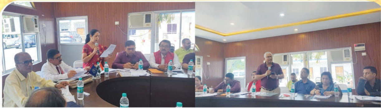
SWC MEETING AT BOKAKHAT