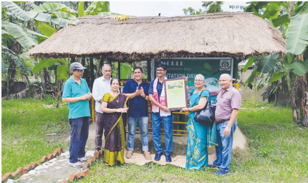
World Environment Day