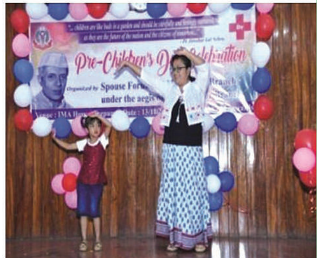
Pre-Children's Day 2022