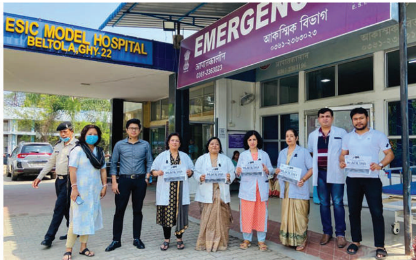
IMA DISPUR. EXPRESSING SOLIDARITY WITH DOCTORS OF RAJASTHAN AGAINST RTH BILL