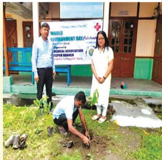
Environment Day 2022