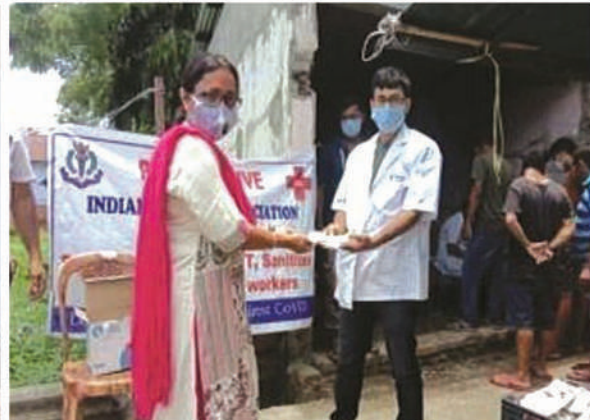
PPE kit Initiative 2021