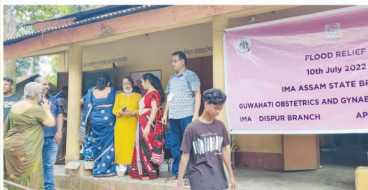
Flood relief camp IMA Asb IMA Dispur and GOGS