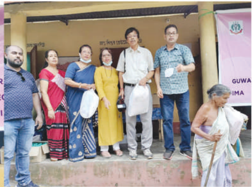
Flood relief camp IMA Asb