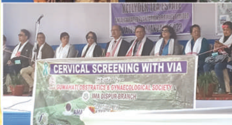
Screening Cancer Activity of Kellyden Tea Estate