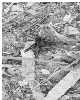
Figure 1C : Chilobrachys stridulance : Venomous tarantula mobile capture by patient family members after bite. This tarantula bitten and hold the finger of the patient for few second. We have to perform amputation of fingertip for necrosis 20 days post bite.